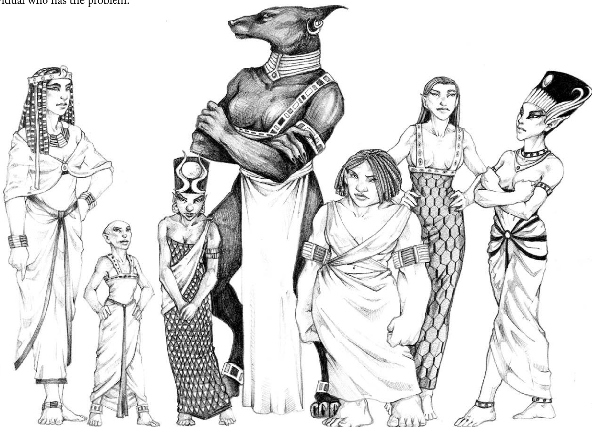
PESEDJER SUTEKHRA ASARI ANPUR PTAHMENU PESEHET ESETERI

Humans take any name common in Khemti, but are especially fond of giving their children names that glorify either themselves, their gods or both. One of the most common naming conventions is to add the suffix “-hotep” (meaning “is pleased”) to a name, to signify approval from either a father