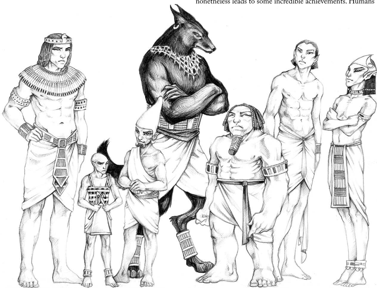
PESEDJER SUTEKHRA ASARI ANPUR PTAHMENU PESESHET ESETERI

Humans are a proud and ambitious race. Their status as the creation of the gods assembled, rather than a single deity, gives them a confidence that often borders on arrogance, but nonetheless leads to some incredible achievements. Humans